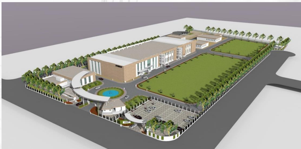
3D view of the proposed manufacturing plant