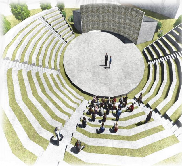
Ruhuna University's Open-air Theater