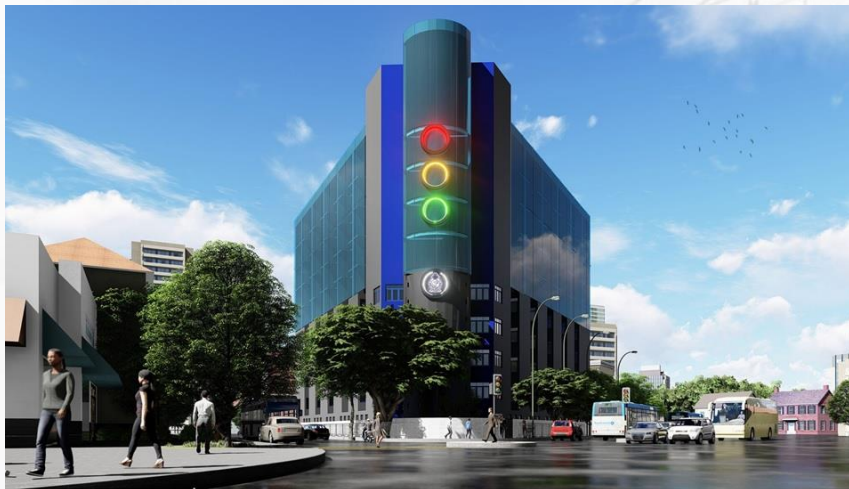
Construction and Completion of Proposed City Traffic Building No 317, Mihindu Mawatha, Colombo 12