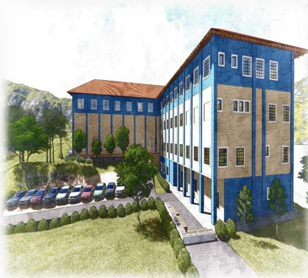
Building Complex – Stage II of the Ruhuna University - Building for the faculty of Management and Finance