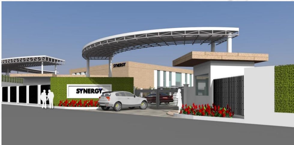
Front 3D view of the proposed manufacturing plant